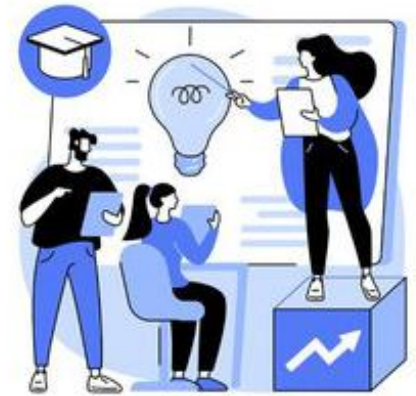
Professional development of teachers